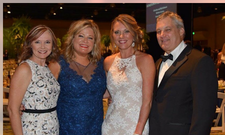
Foundation Officers: (left to right)

Suicide is preventable, and our vision is to be a suicide-free community. This must be a community-wide movement, starting with our children, our schools and homes.